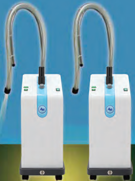
MODEL NO. EV-1000

Perfect elimination of smoke and smell happened while laser operation